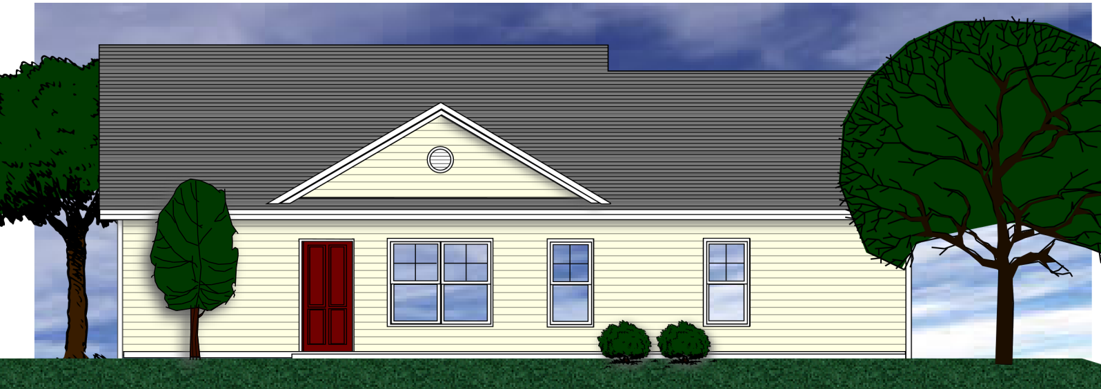
REAR ELEVATION SCALE: 1/8" = 1'-0"

Benjamin Gecy Office (843) 524-2404 Mobile (843) 441-2482