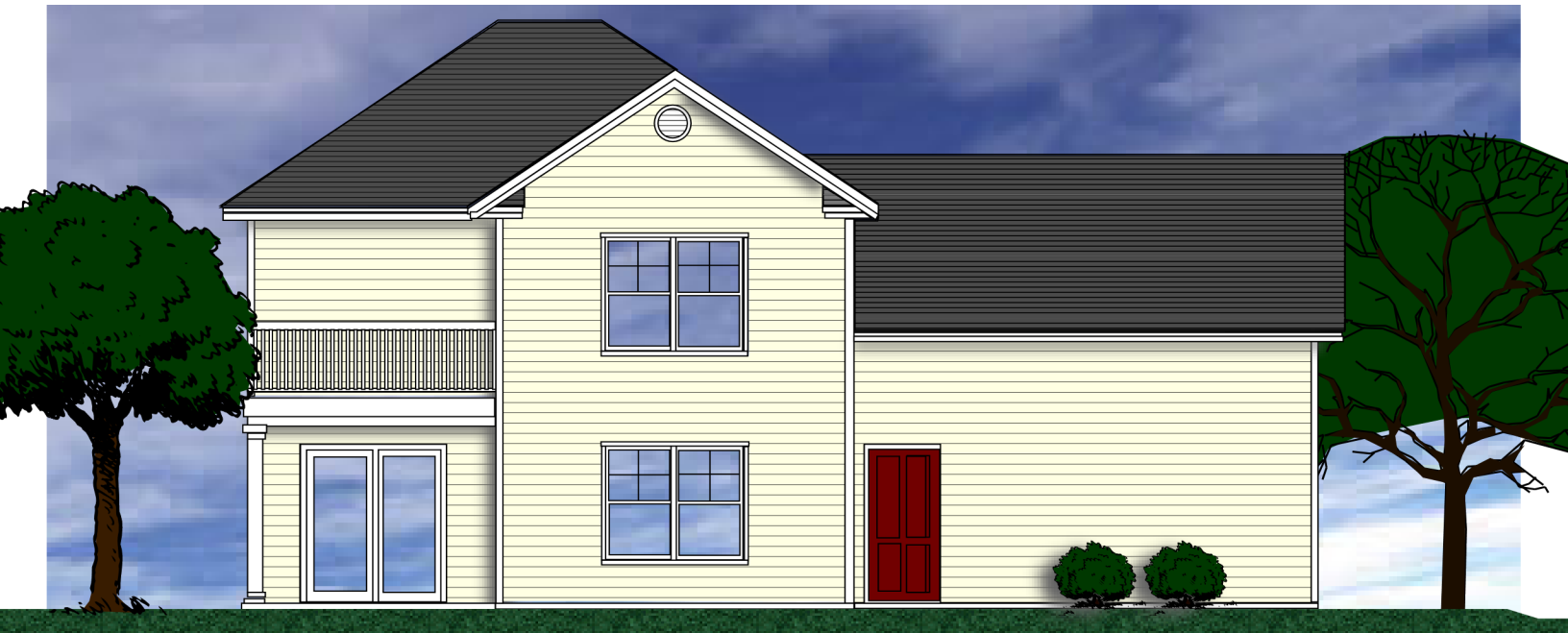
REAR ELEVATION SCALE: 1/8" = 1'-0"

Benjamin Gecy Office (843) 524-2404 Mobile (843) 441-2482